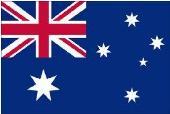
The flag of Australia