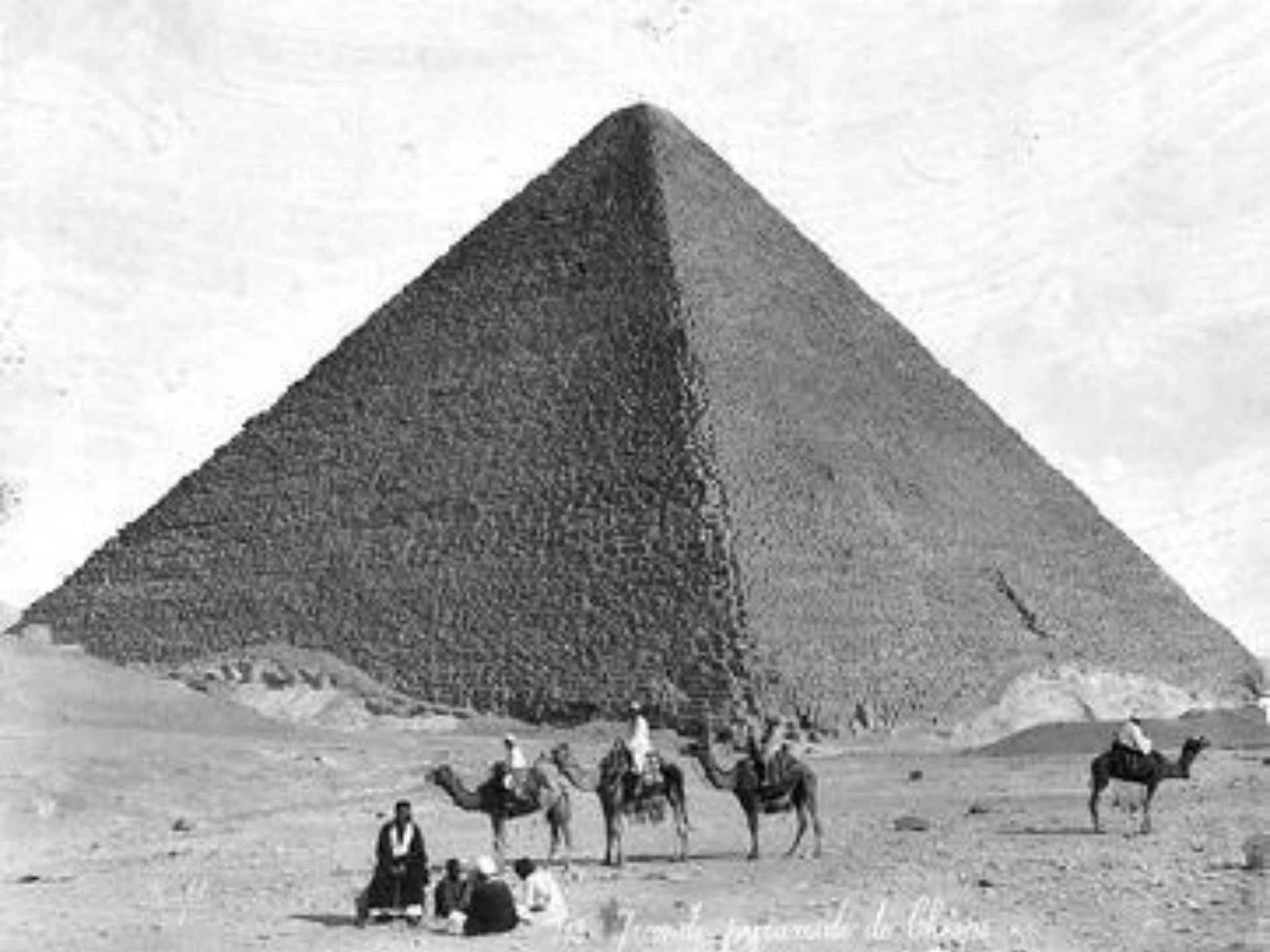
Pyramide pyramide de Gizeh