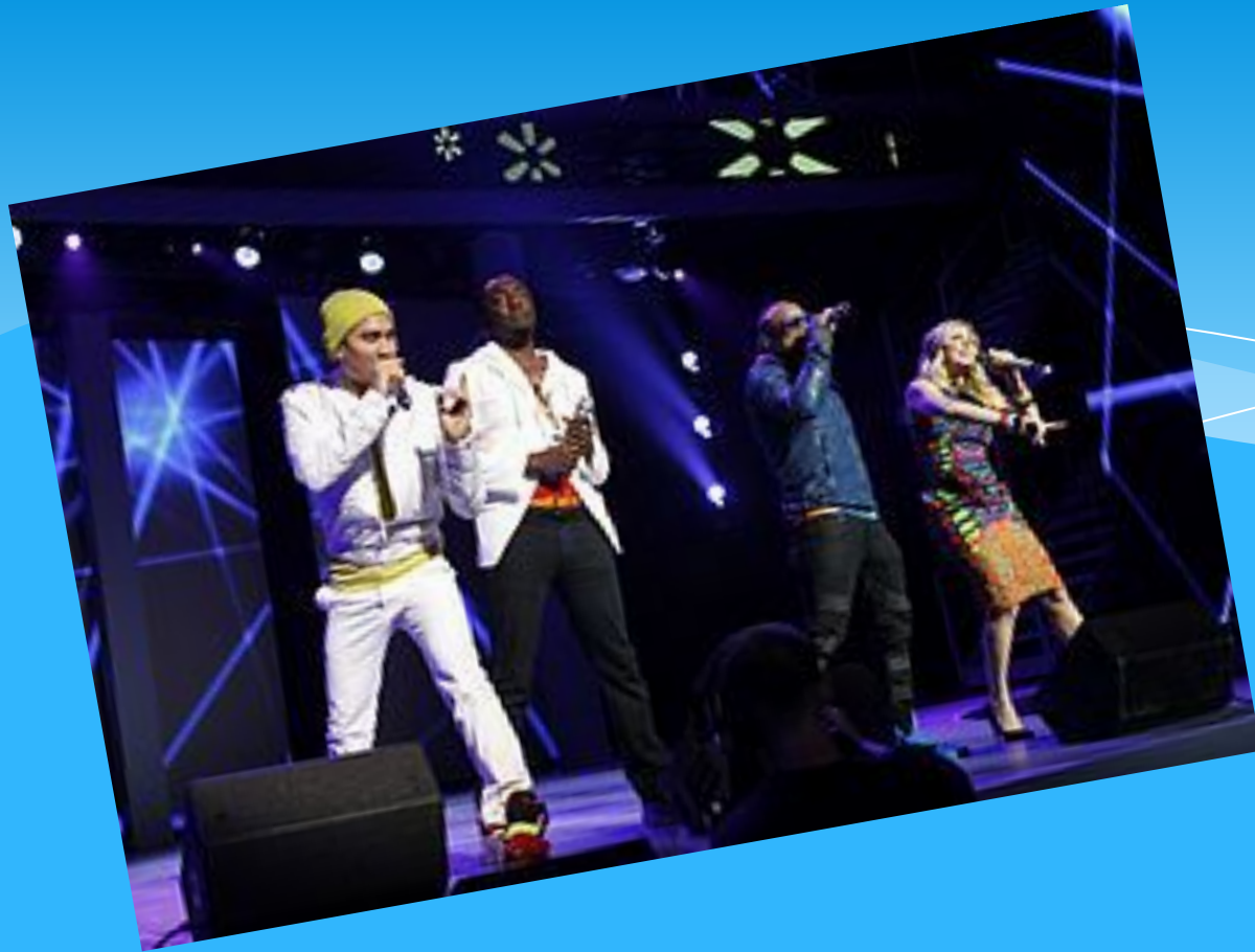
THE BLACK EYED PEAS, FROM LEFT TO RIGHT: TABOO, WILL.I.AM , APL.DE.AP, AND FERGIE