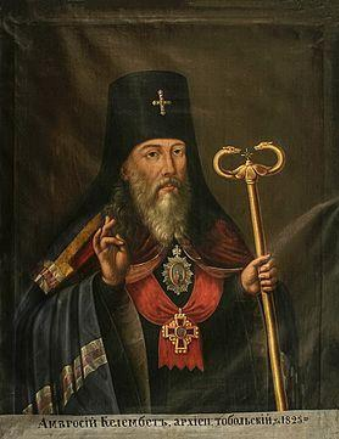
Амвросій Кедембетъ, архіеп. тобольскій, 1823