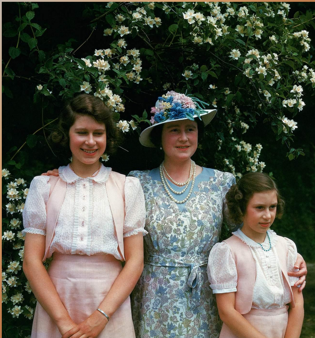
The sisters with their mother at Windsor in 1943