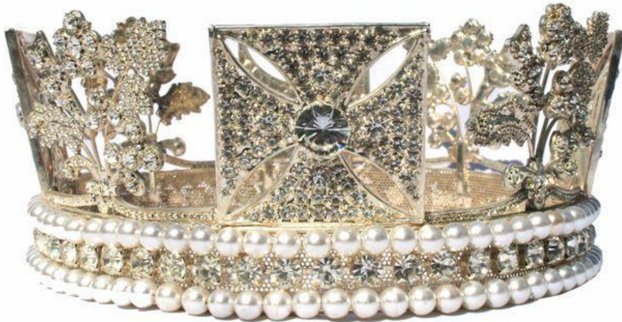
The George IV State Diadem, officially the Diamond Diadem. Queen Elizabeth II wore the diadem in the procession to her coronation in 1953, and she also wears it in the procession to and from the annual State Opening of Parliament