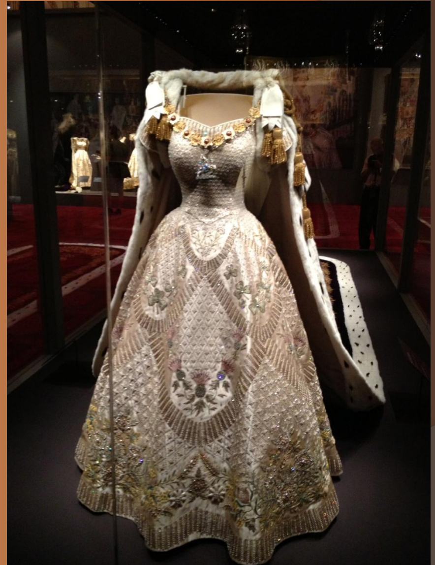
The Queen's coronation dress