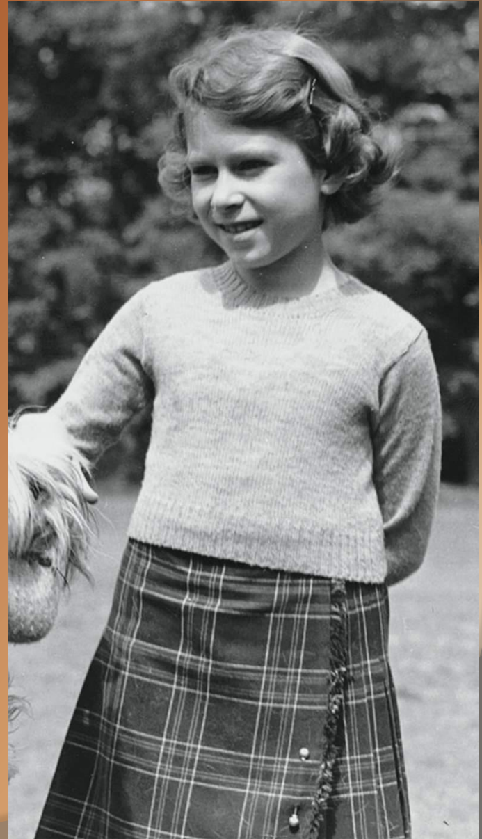
Elizabeth at the Royal Lodge in 1936