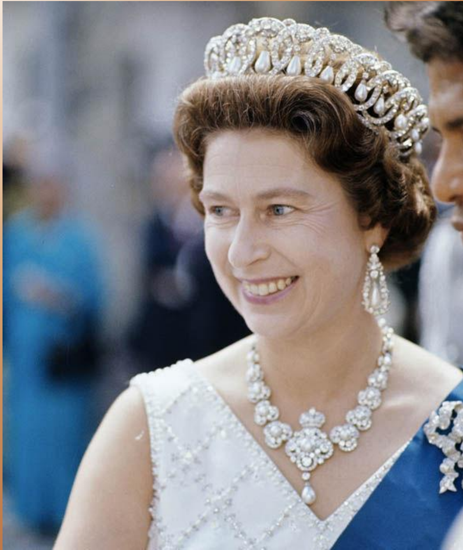
The Grand Duchess Vladimir tiara.