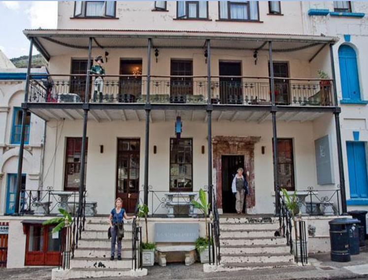
Hotel The Consulate