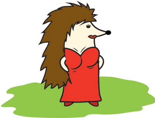
A big breasted hedgehog?