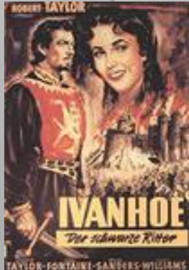
Sir Walter Scott «Ivanhoe»