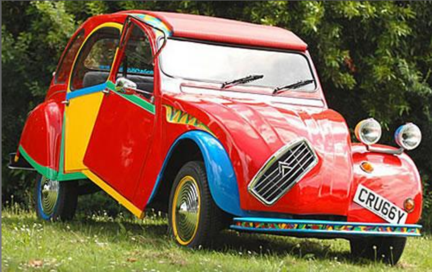
● Picasso's Car