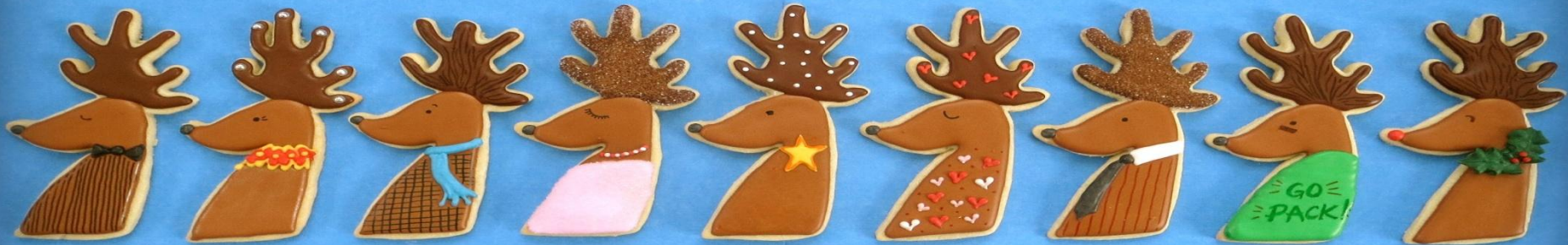
Dasher Dancer Prancer Vixen Comet Cupid Donner Blitzen Rudolf