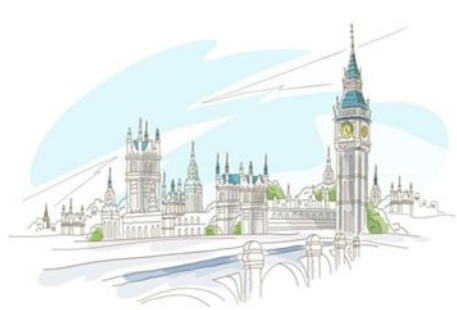
The Houses of Parliament