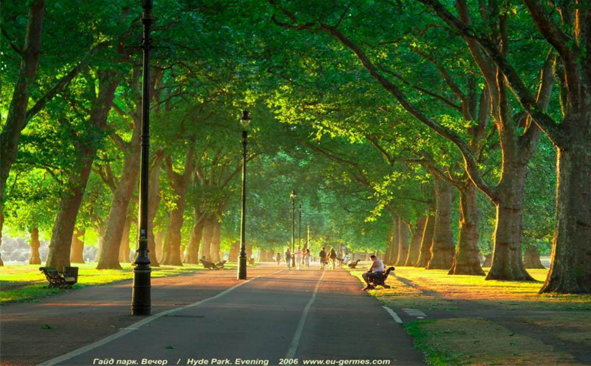
Гайд парк. Вечер / Hyde Park. Evening 2006 www.eu-germes.com