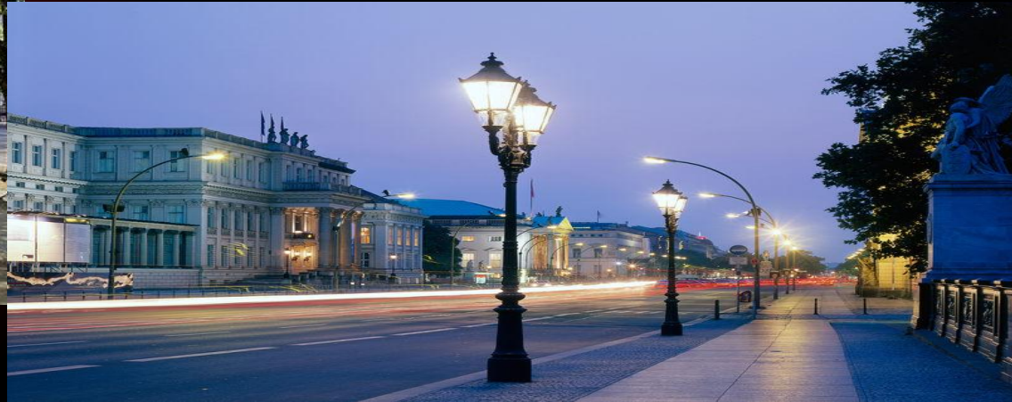
Statue of Friedrich Wilhelm

Unter den Linden Unter den Linden, a main east-west thoroughfare through the city of Berlin, earned its name from the rows of linden trees that were first planted there more than three-and-a-half centuries ago.