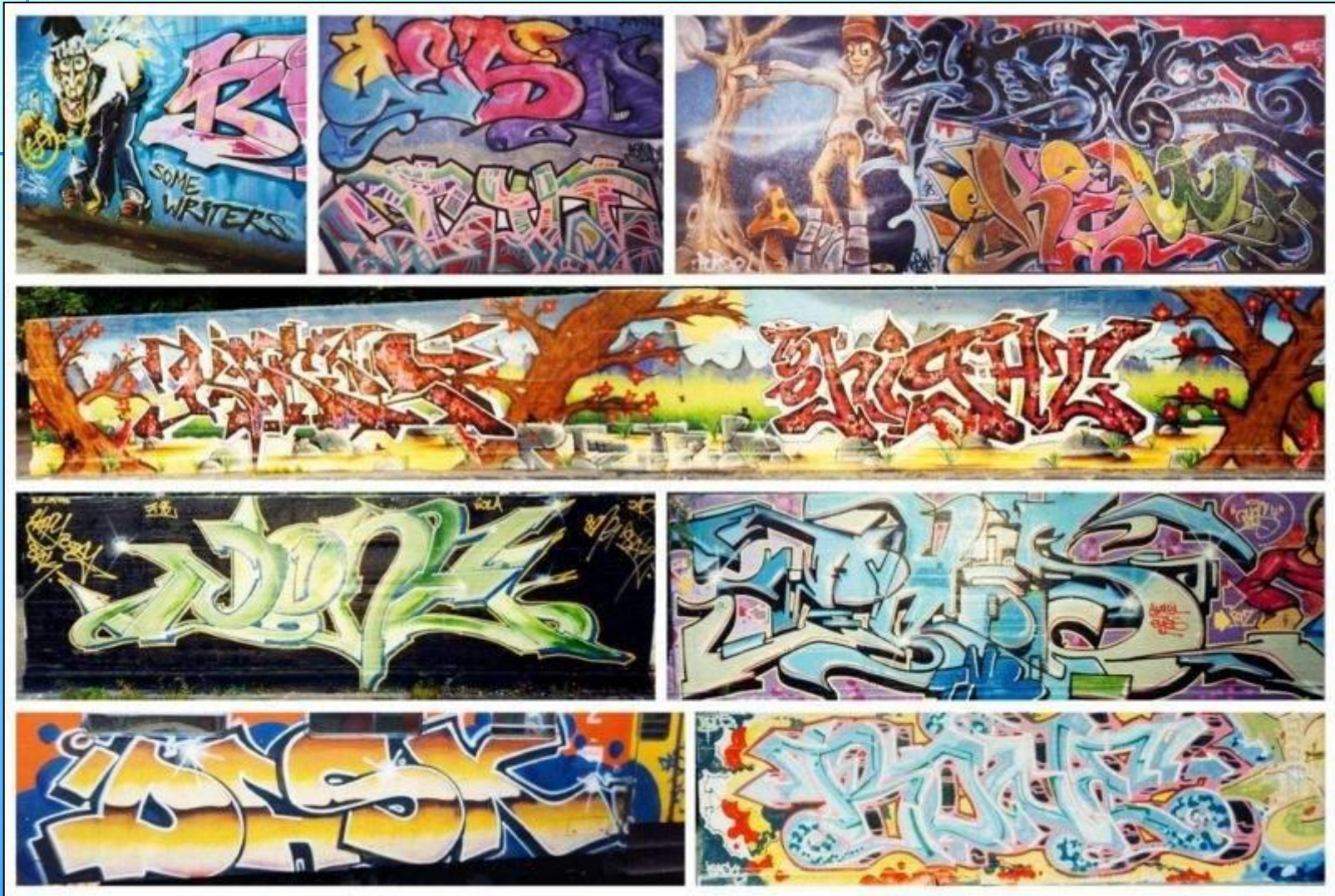
EXAMPLES OF MODERN GRAFFITI STYLES

Sometimes graffiti is employed to communicate social and political messages.