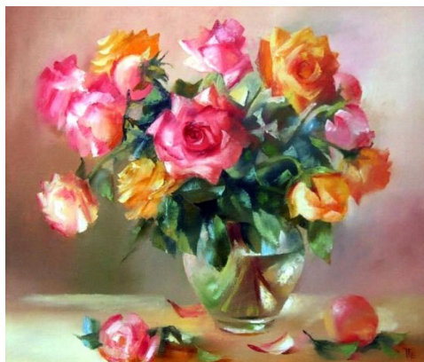
Te E. «Roses»