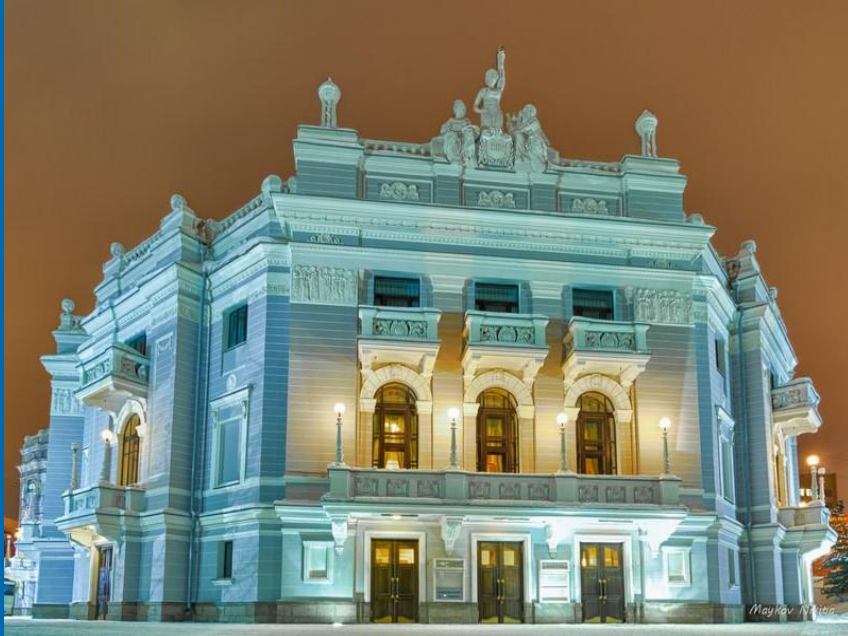
The Theatre of Opera and Balet