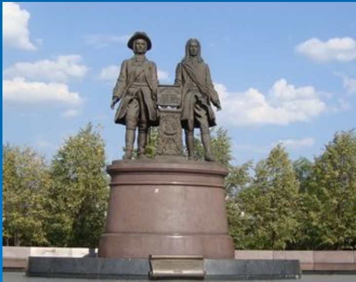
Monument to the founders of Yekaterinburg