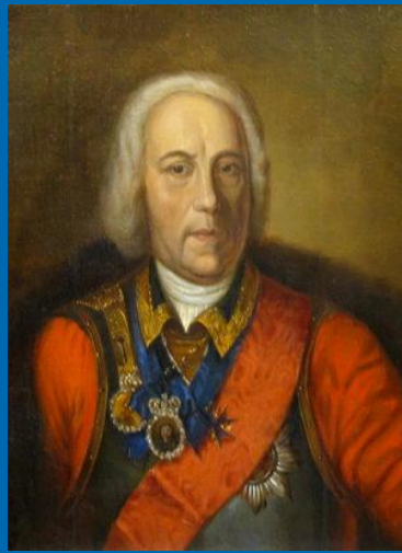
George Wilhem de Gennin