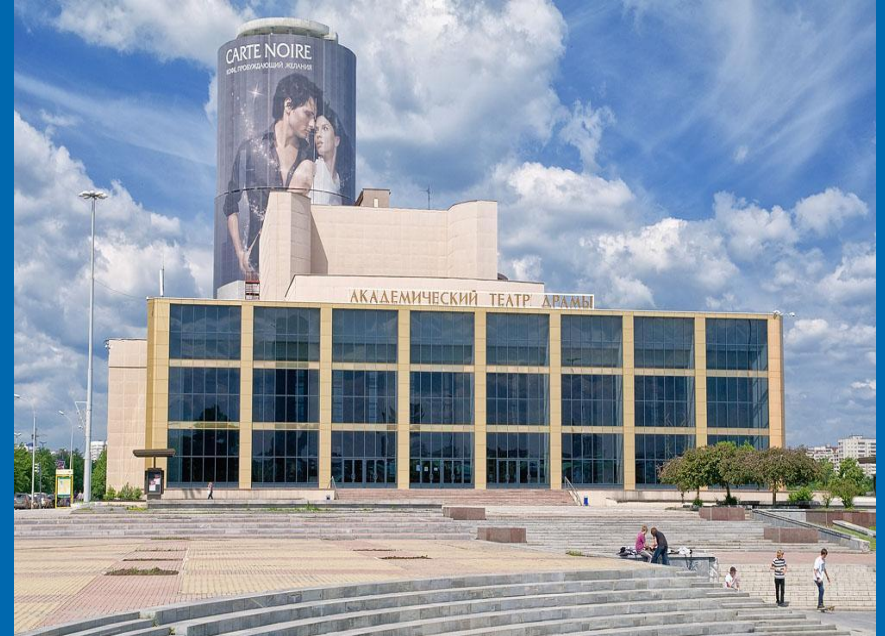
The Drama Theatre