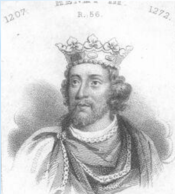
King Henry III

Henry III built a luxurious royal palace within the castle during the middle of the century, and Edward III went further, rebuilding the palace to make an even grander set of buildings in what would become "the most expensive secular building project of the entire Middle Ages in England". Edward's core design lasted through the Tudor period, during which Henry VIII and Elizabeth I made increasing use of the castle as a royal court and centre for diplomatic entertainment.