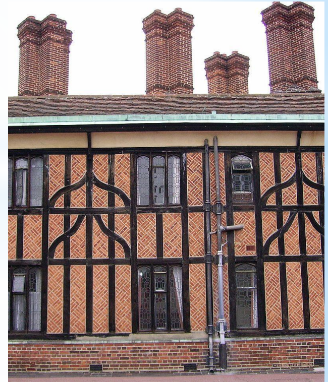
The Horseshoe Cloister, built in 1480 and reconstructed in the 19th century