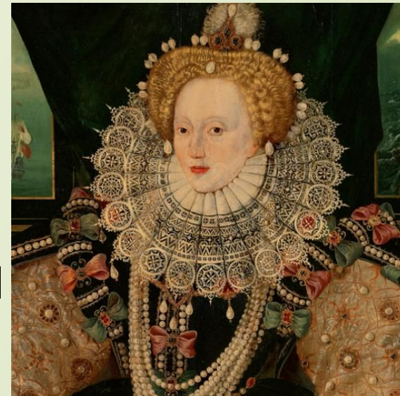
Queen Elisabeth I