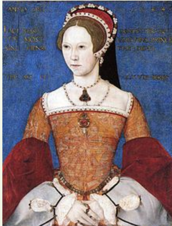
Queen Mary I