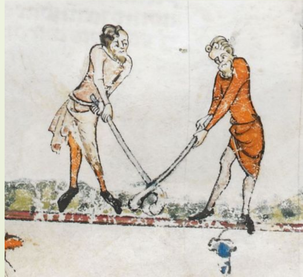
The game of hurling