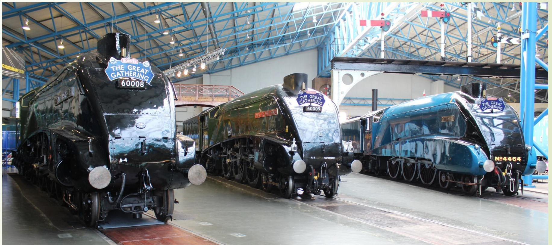
National railway Museum