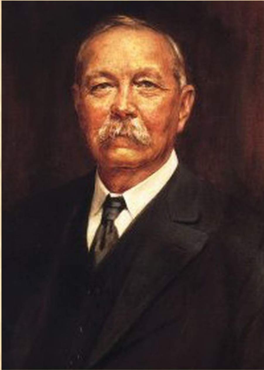
Arthur Conan Doyle