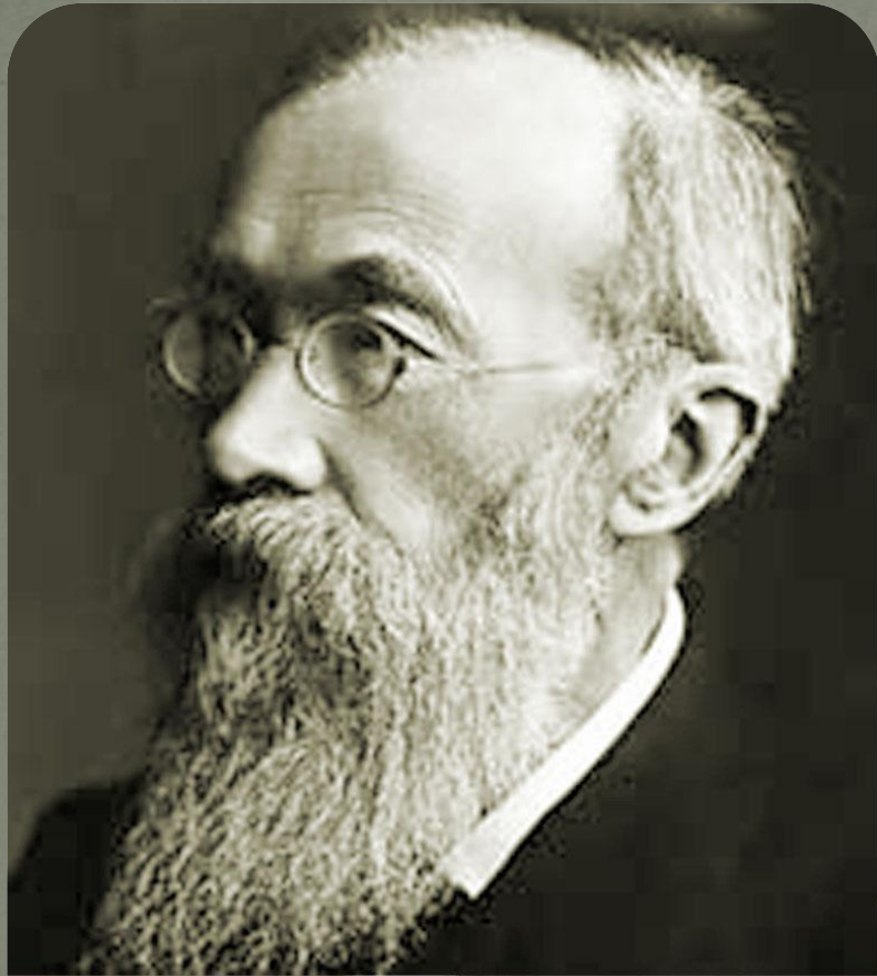
Вильгельм Вундт ВНПРЛСНН ВЛНЦЛ