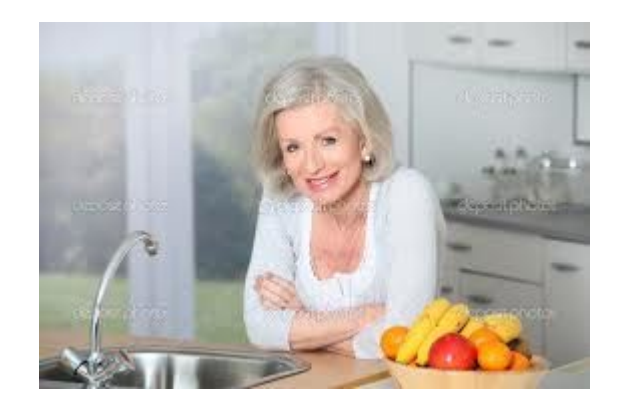
She's in the kitchen