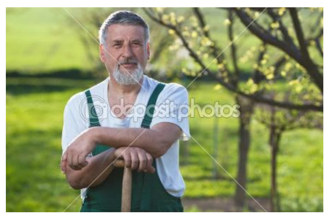
He's in the garden