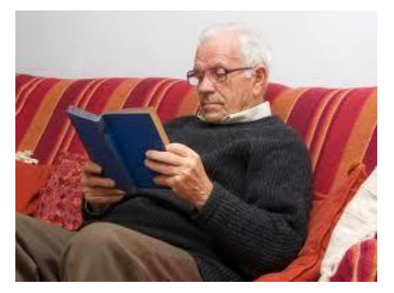
Where's Grandpa? He's in the living room