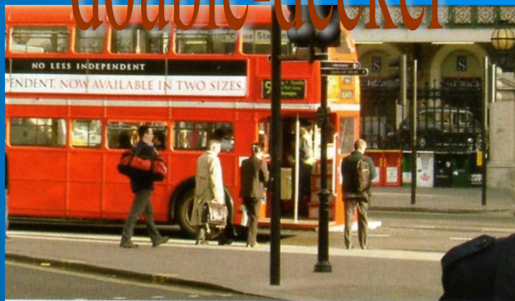
A A good way to see the city