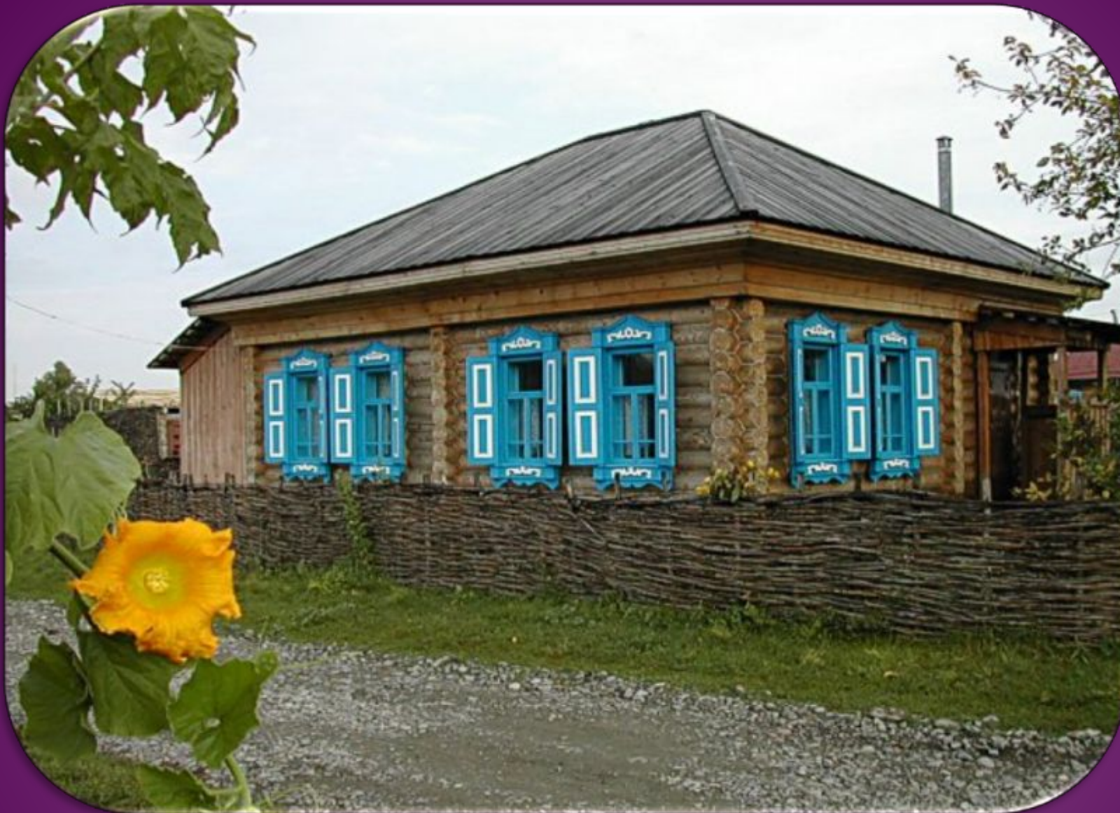
The house, where V.M. Shukshin spent his childhood and youth.