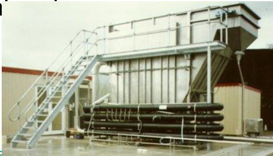
Dissolved air flotation system for treating industrial wastewater.