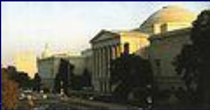
the West building of the National Gallery of Art, with the East Building and the US Capitol