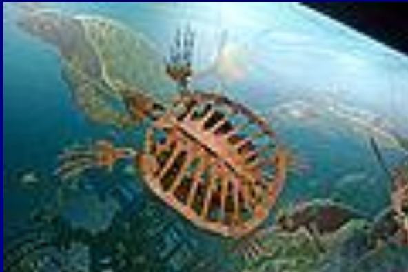
The skeleton of a prehistoric sea turtle