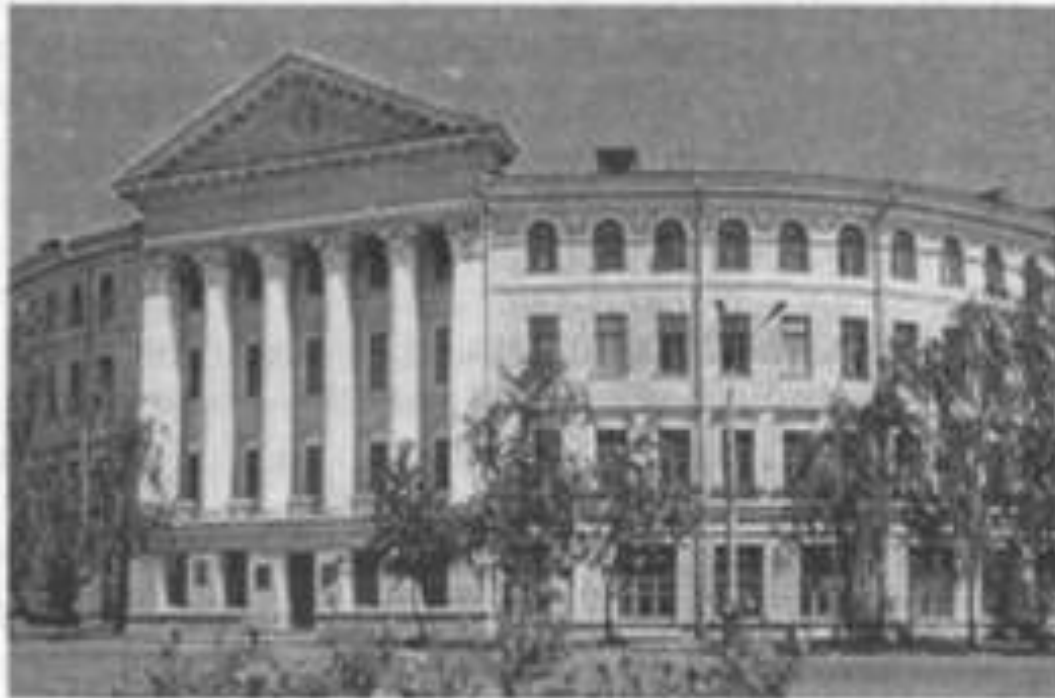
Національний університет «Кисво-Могилянська академія».