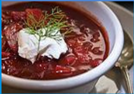
Ukrainian borscht soup with smetana