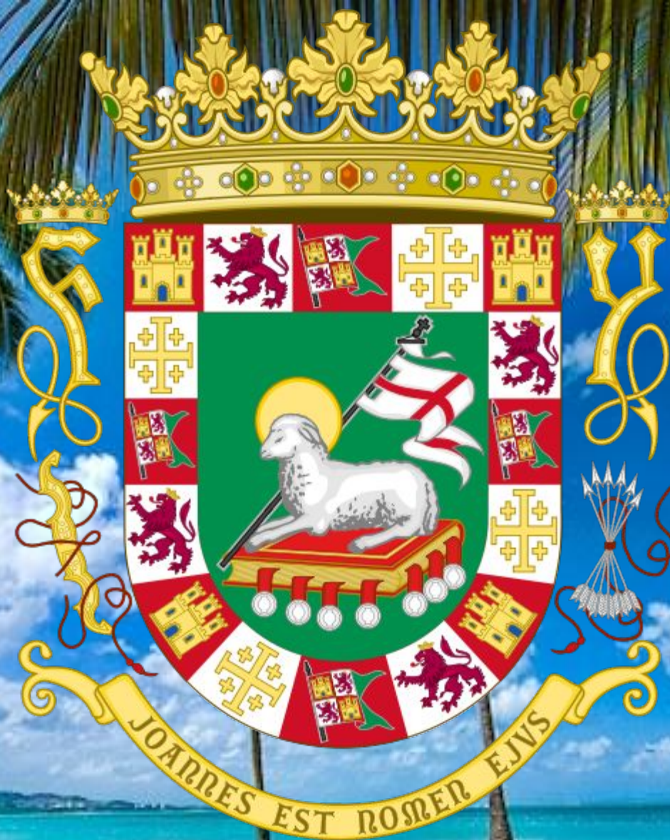
Coat of Arms of the Commonwealth of Puerto Rico