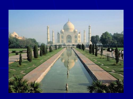
park monument statue