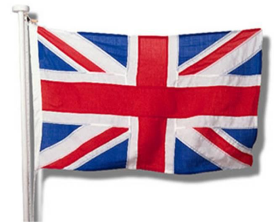
• А це прапор Великобританії