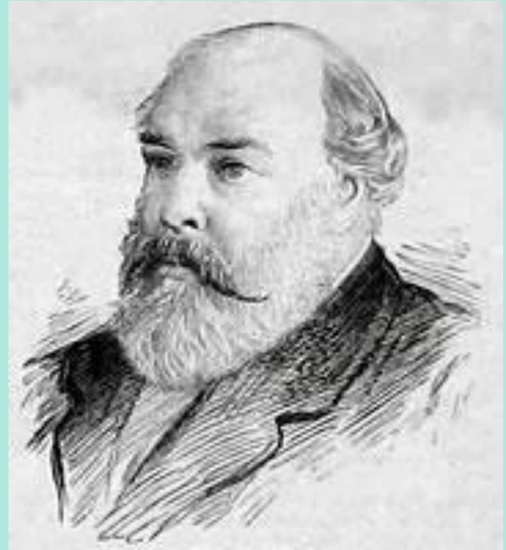
Sir Horace Jones

The city architect Horace Jones together with John Wolfe-Barry produced the design for the Tower Bridge. It was a mixture of a bascule and suspension bridge. Construction work started in 1886 and took eight years.