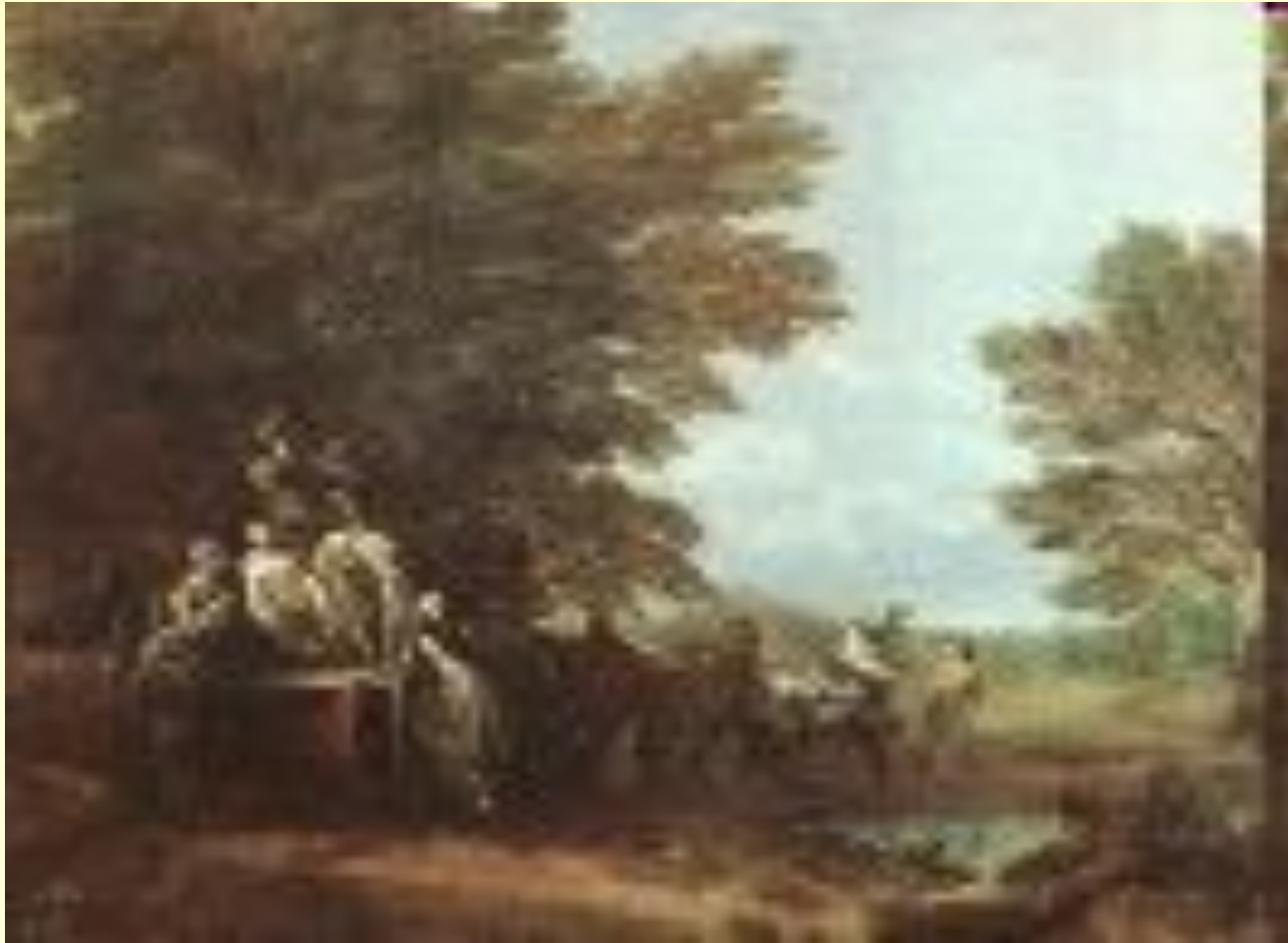
The Harvest Wagon (c. 1767)