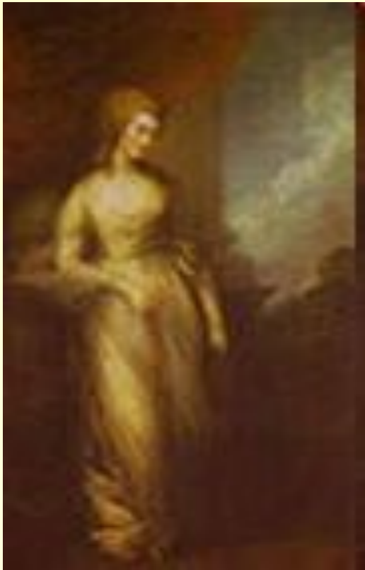
Her Grace Georgiana Cavendish, Duchess of Devonshire (1783)