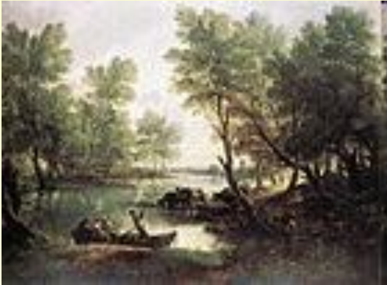
River Landscape (1768–1770)