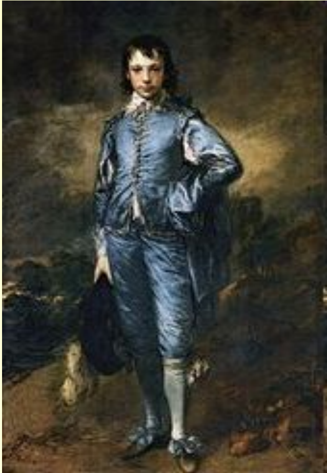
The Blue Boy (1770).