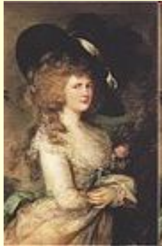
Her Grace Georgiana Cavendish (1787)