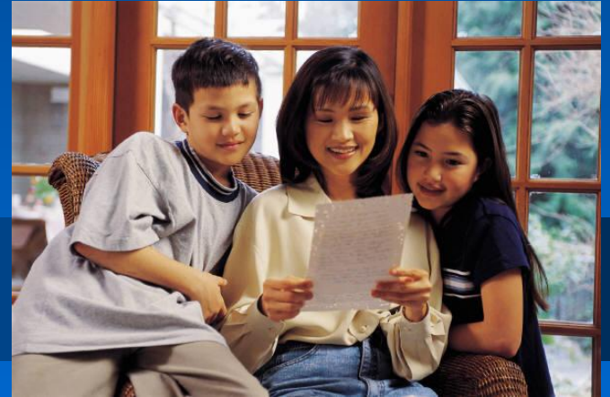
Relationship with the mates