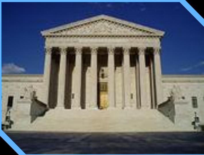
The front of the United States Supreme Court building.