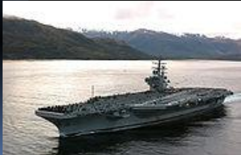
The USA Ronald Reagan supercarrier.