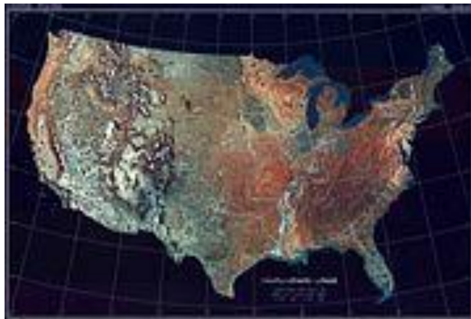
TOPOGRAPHIC MAP OF THE CONTIGUOUS US.