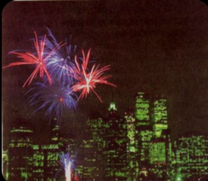
Firework on Independence Day.