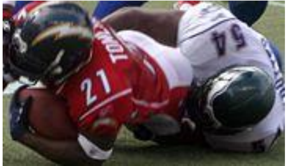
The Pro Bowl (2006), American football's annual all-star game.(puc 6)