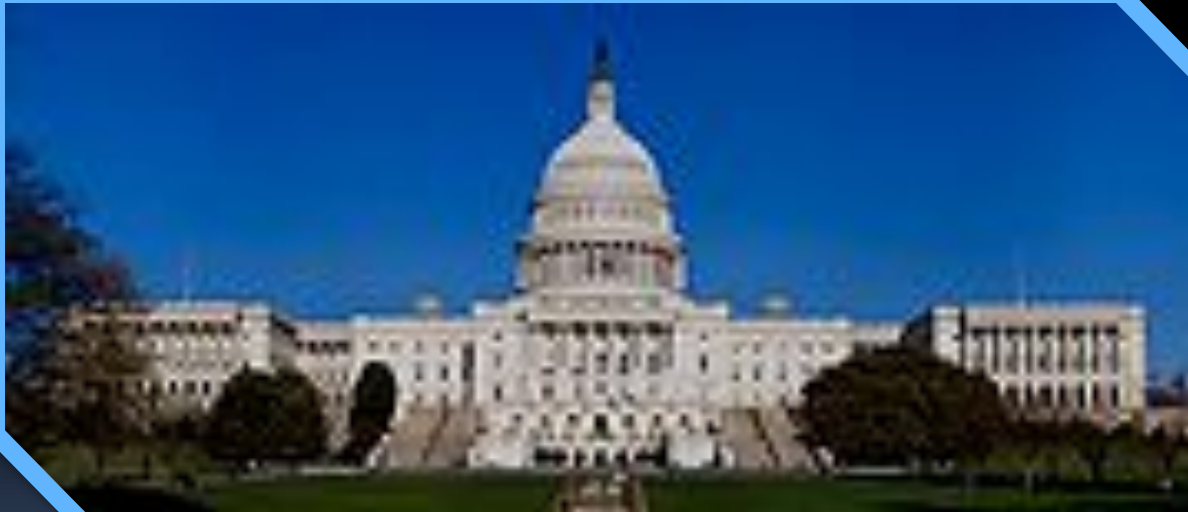
The west front of the United States Capitol, which houses the United States Congress.(puc 4.)