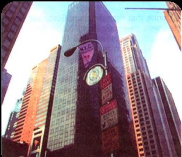
Skyscrapers in New York.