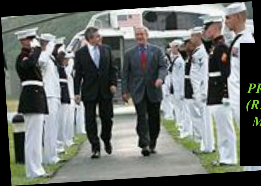
PRESIDENT GEORGE W. BUSH (RIGHT) WITH BRITISH PRIME MINISTER GORDON BROWN.