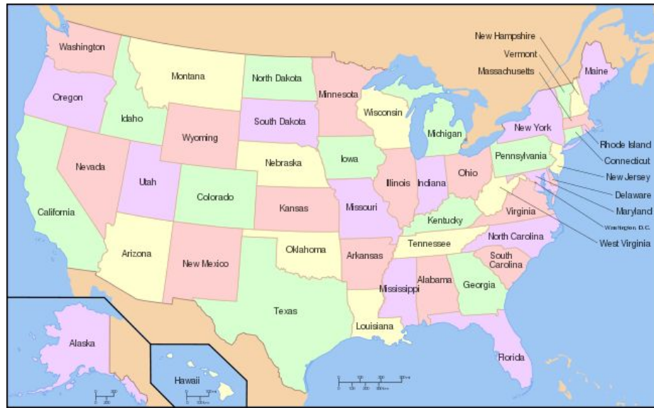
Map of USA with state names.