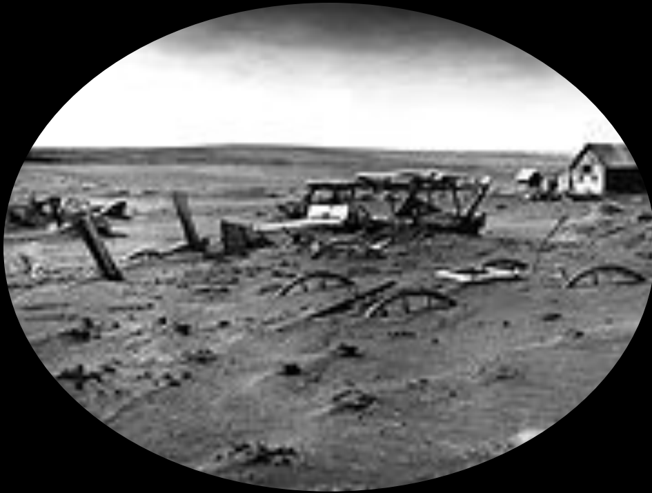
An abandoned farm in South Dakota during the Dust Bowl, 1936.

The bald eagle has been the national bird of the US since 1782.