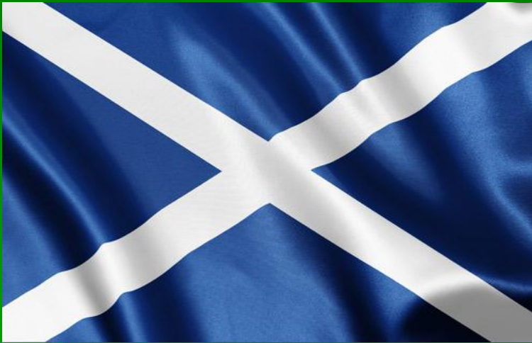
The flag of Scotland