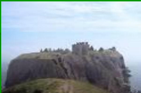
The Grampian Mountains