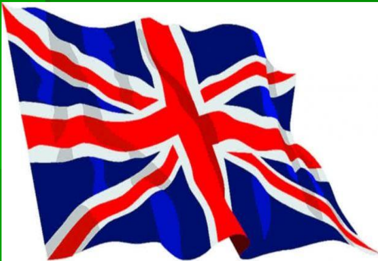
The flag of England