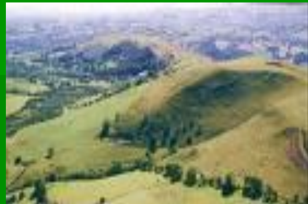
The Cambrian Mountains