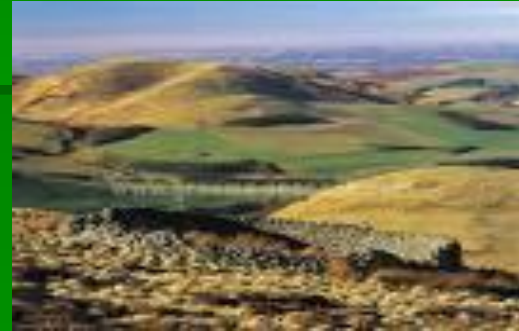
The Cheviot Hills