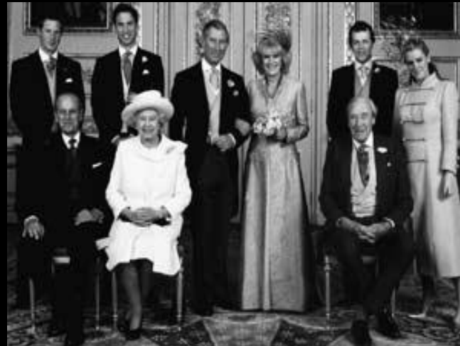
The Prince of Wales, the new Duchess of Cornwall and families after their wedding at Windsor on 9 April 2005

His title is the Prince of Wales. He studied at Trinity College, Cambridge, before serving in the Royal Air Force and Royal Navy. He is known for his interest in architecture and the environment.