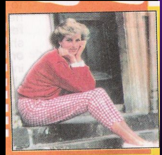
It was summer 1986.

The world was her stage and she dressed for the role of leading lady. She became a woman of vision, queen of style.