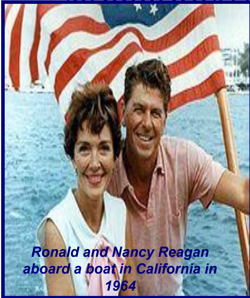
Ronald and Nancy Reagan aboard a boat in California in 1964