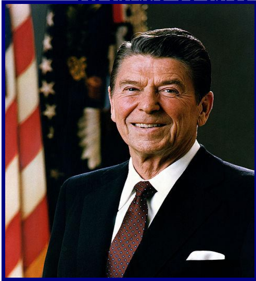
The official portrait of the president Reagan, 1981

Ronald Wilson Reagan (February 6, 1911 – June 5, 2004) was the 40th President of the United States, the 33rd Governor of California and prior to that, an actor.