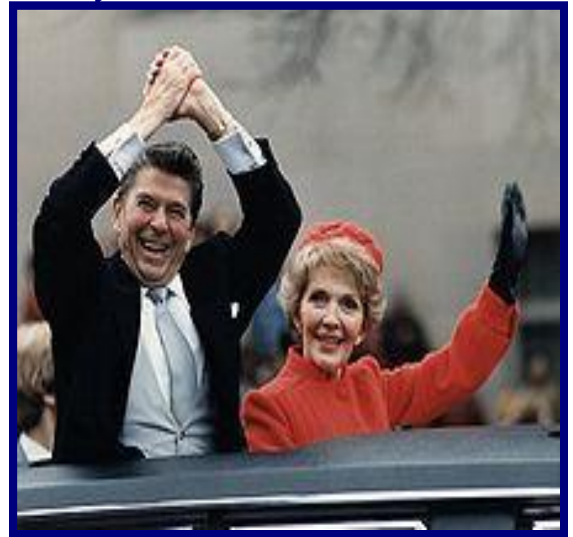
Reagan wave from the limousine taking them down Pennsylvania Avenue to the White House, after inauguration