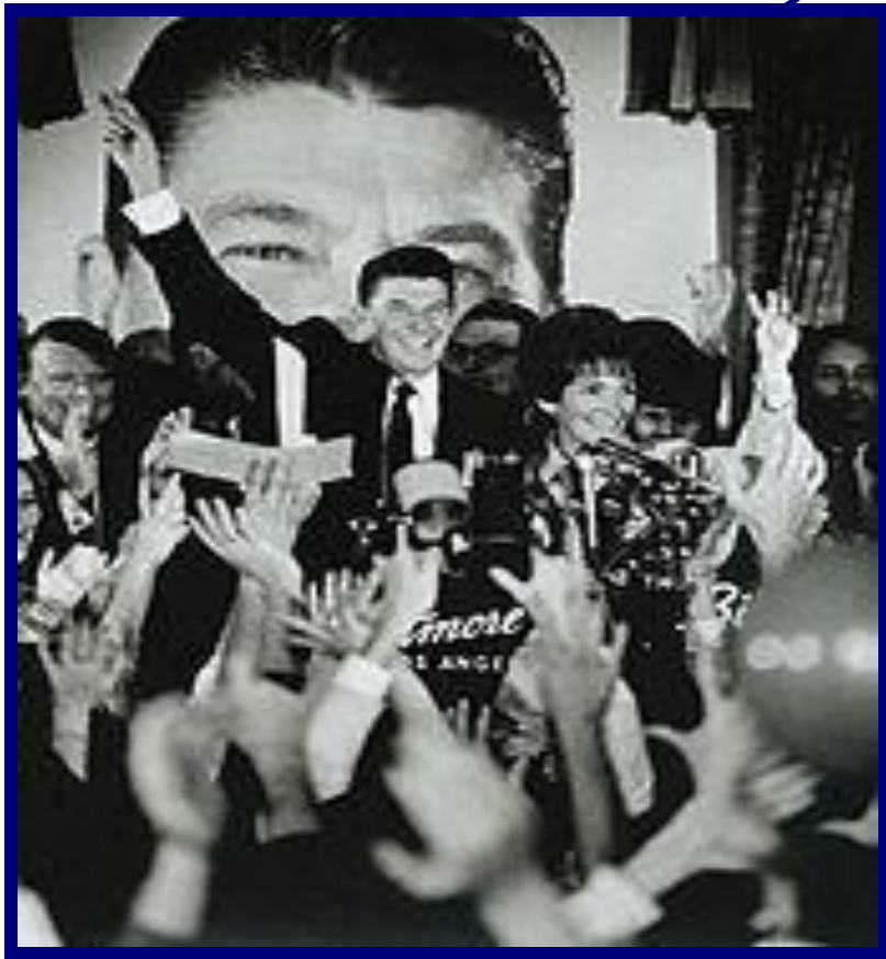
Ronald and Nancy celebrate Reagan's gubernatorial victory