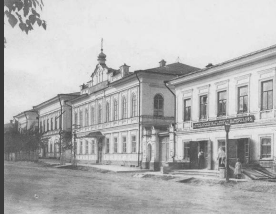
Leninogorsk medical college