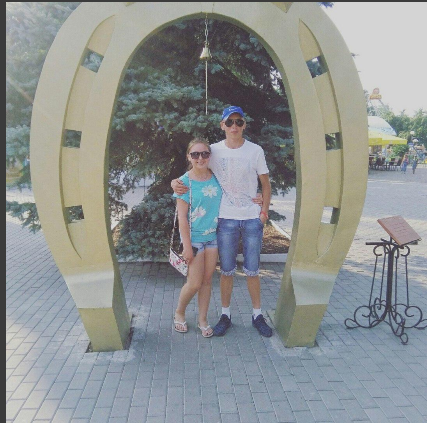
I and Brother