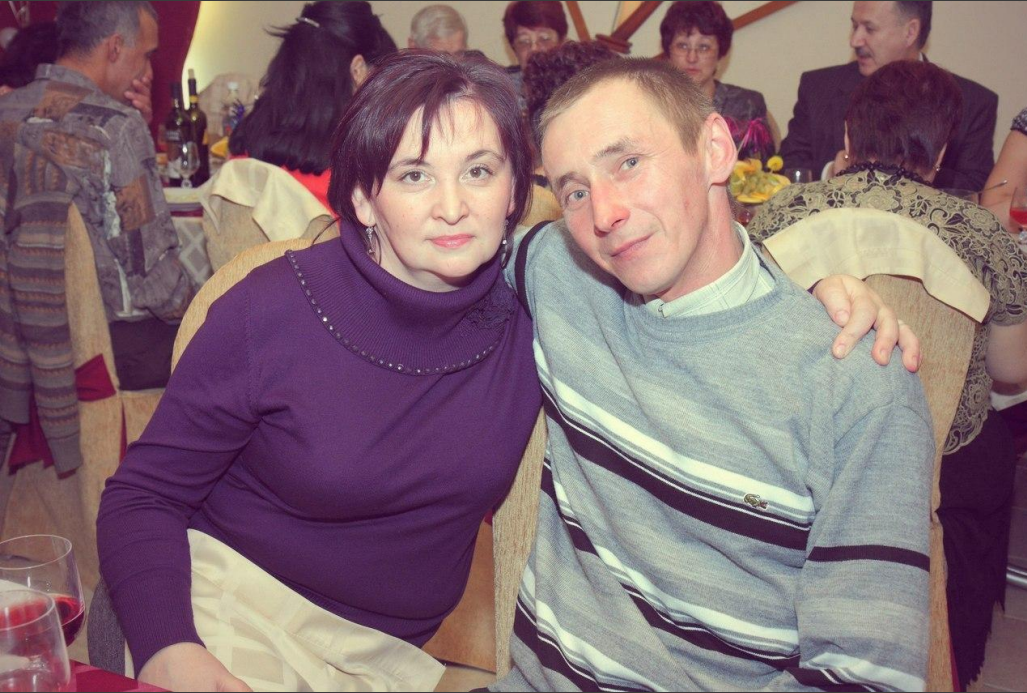
Mother and Father