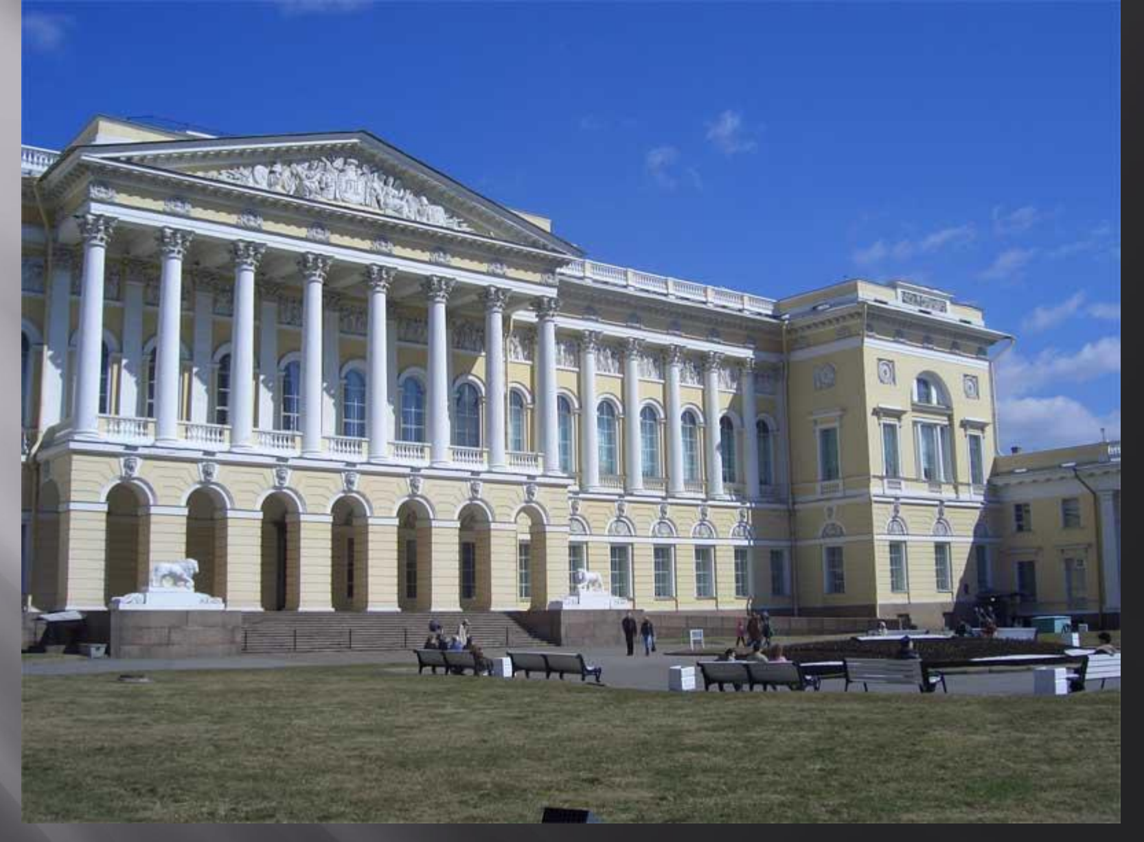
The palace was built after the design of the architect