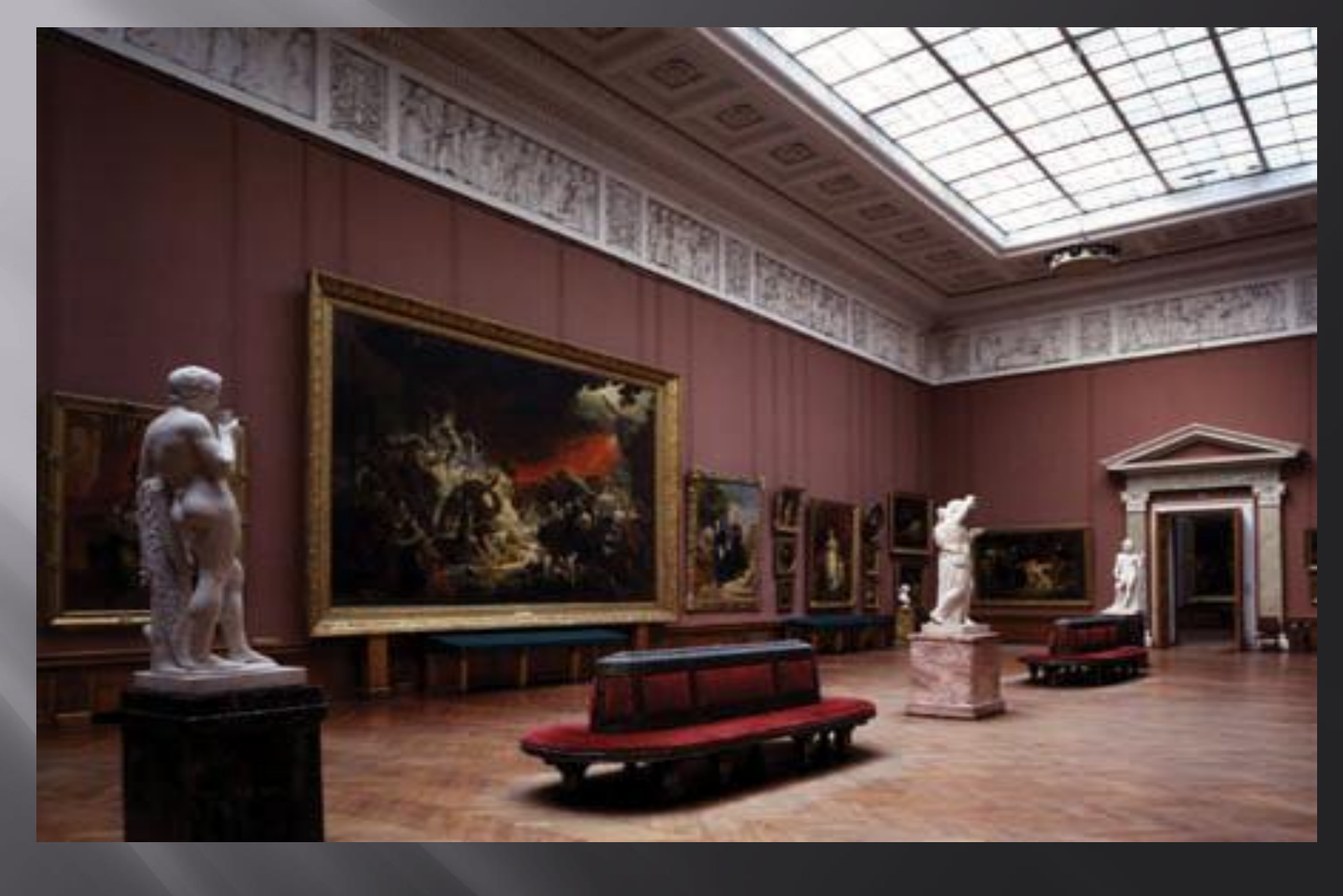
The State Russian museum was inaugurated in the palace in