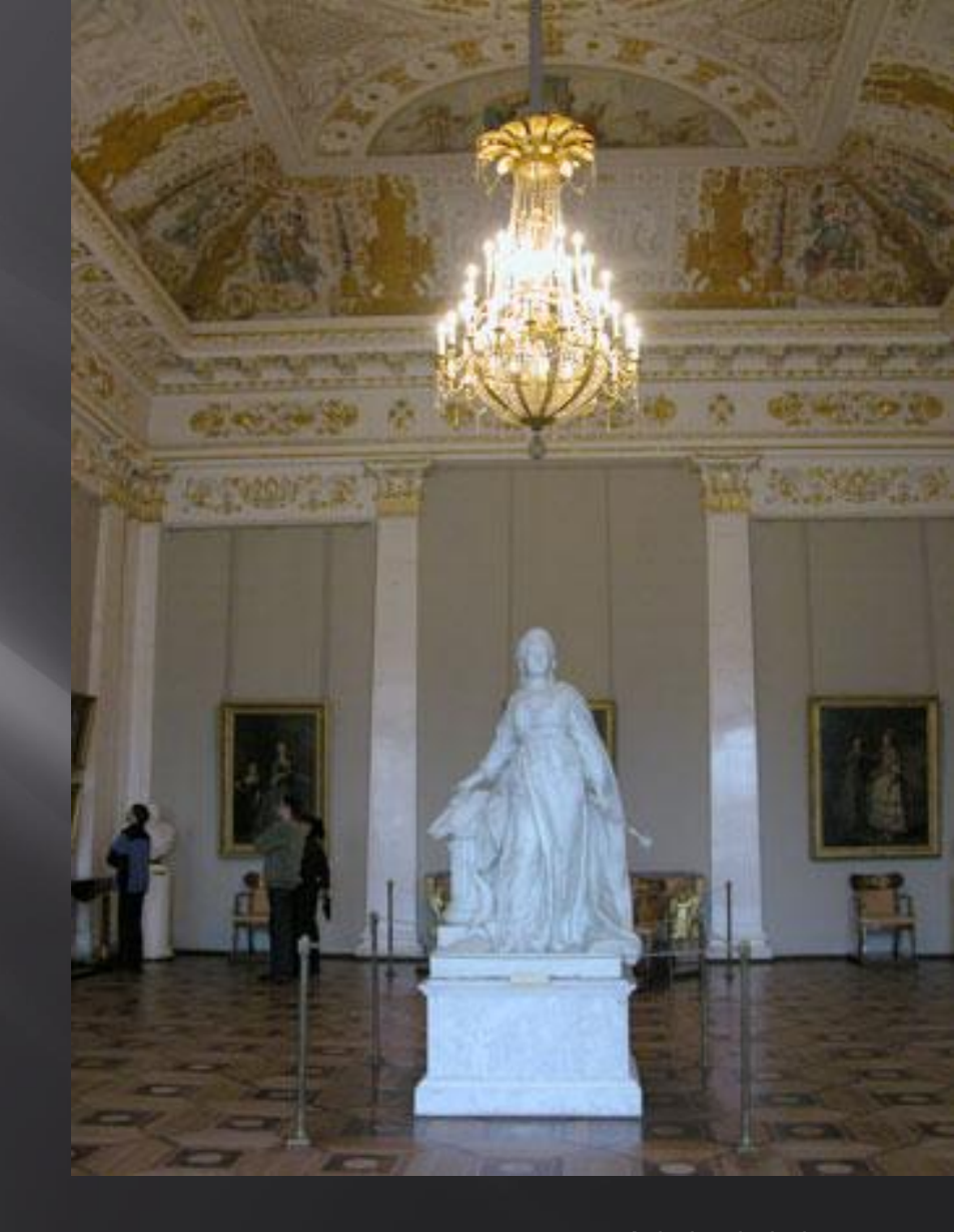
The collection of the State Russian Museum amounts to 400.000 exhibits of paintings, graphic art, sculpture, decorative and fork art