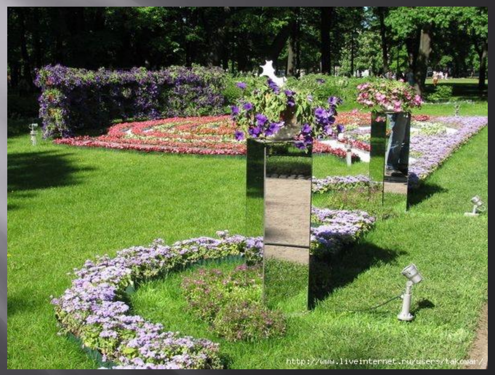
The Mikhailovsky Garden is full of flowers.