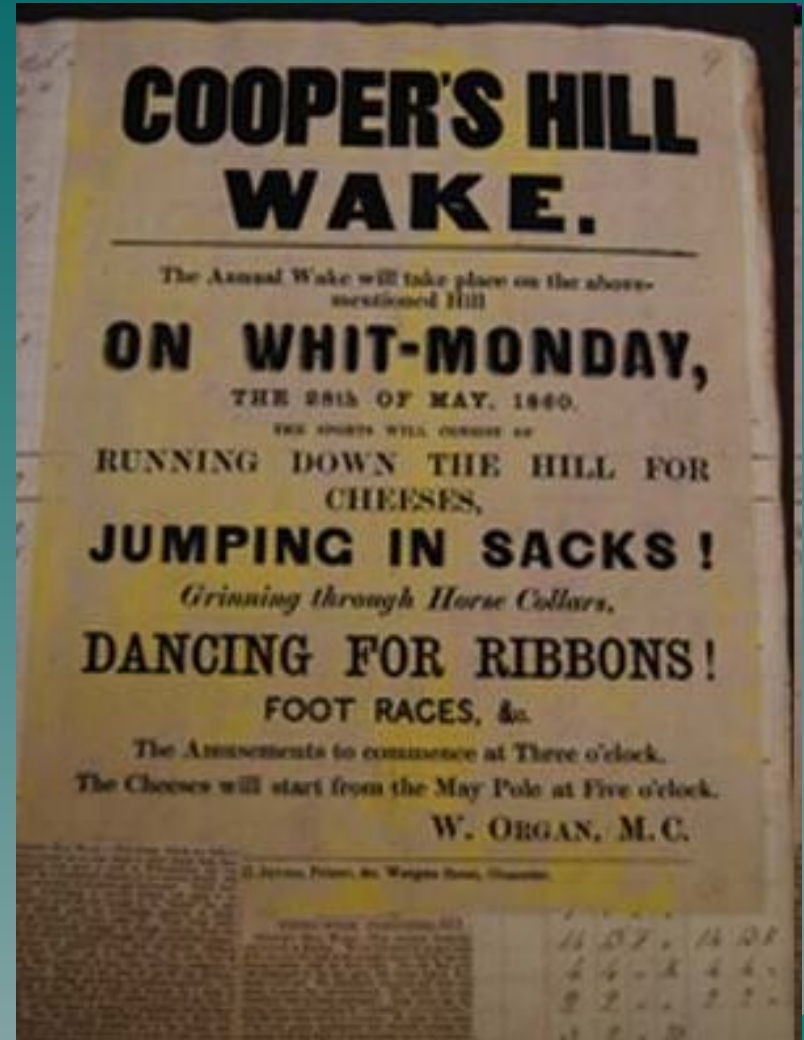
Cheese Rolling Poster from 1860