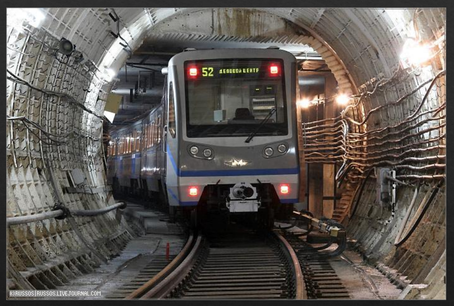
An underground rapid transit rail