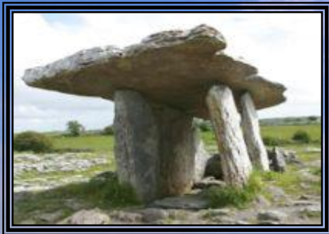
Poulnabrone dolmen, Ireland.