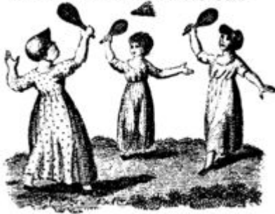
3 Battledore and Shuttlecock.