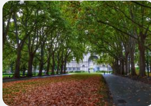
Royal Exhibition Building