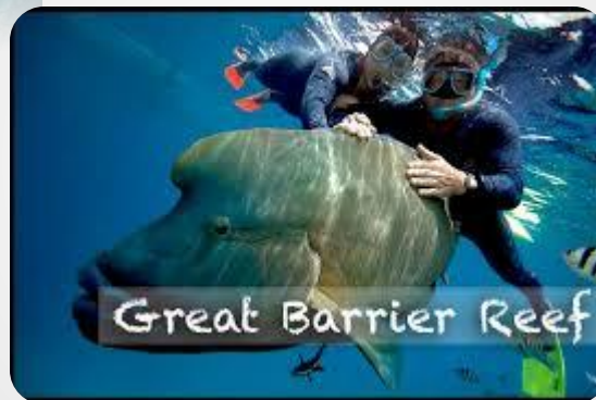
Great Barrier Reef