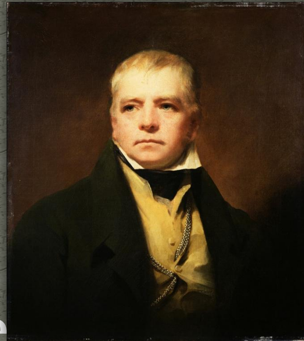
Sir Walter Scott