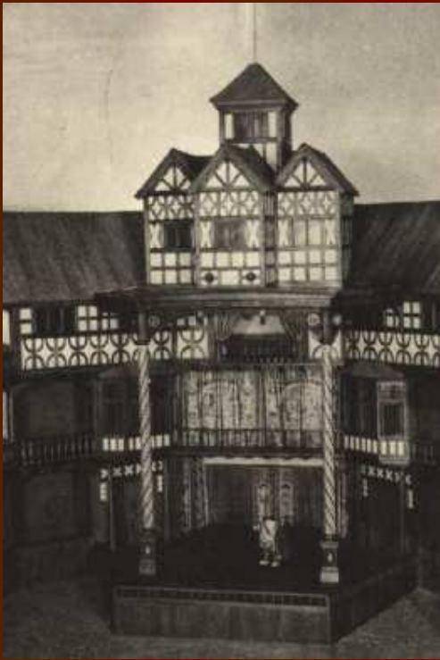
Entrance of The Globe Theater