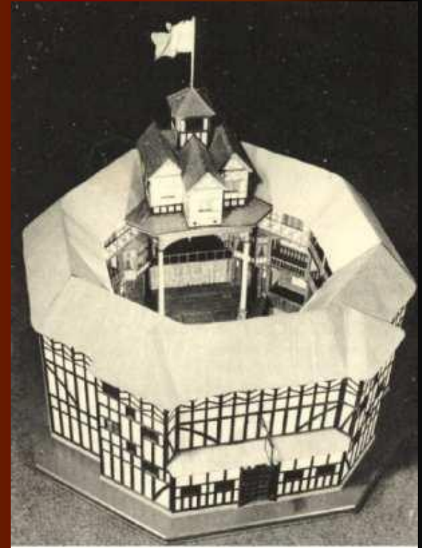
Top view of Shakespeare's Globe Theater