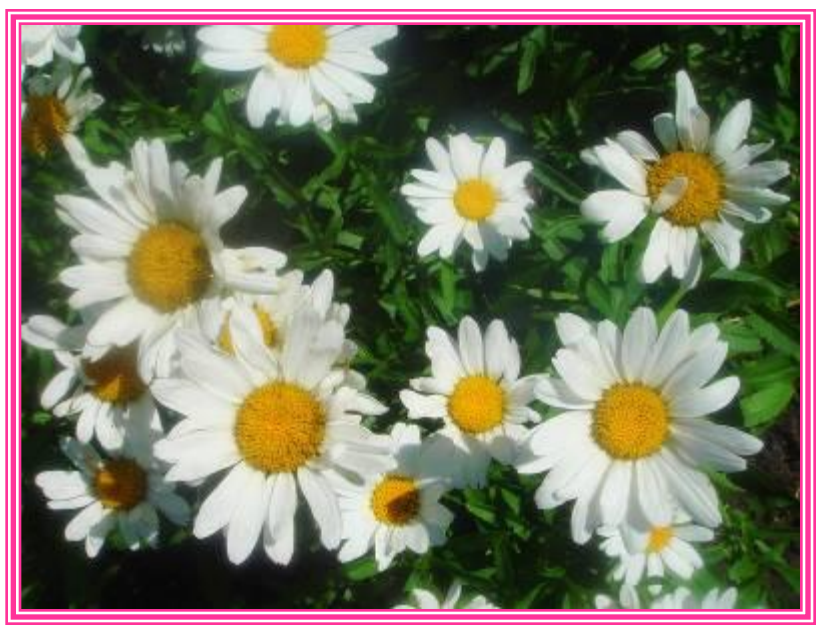
Summer is bright