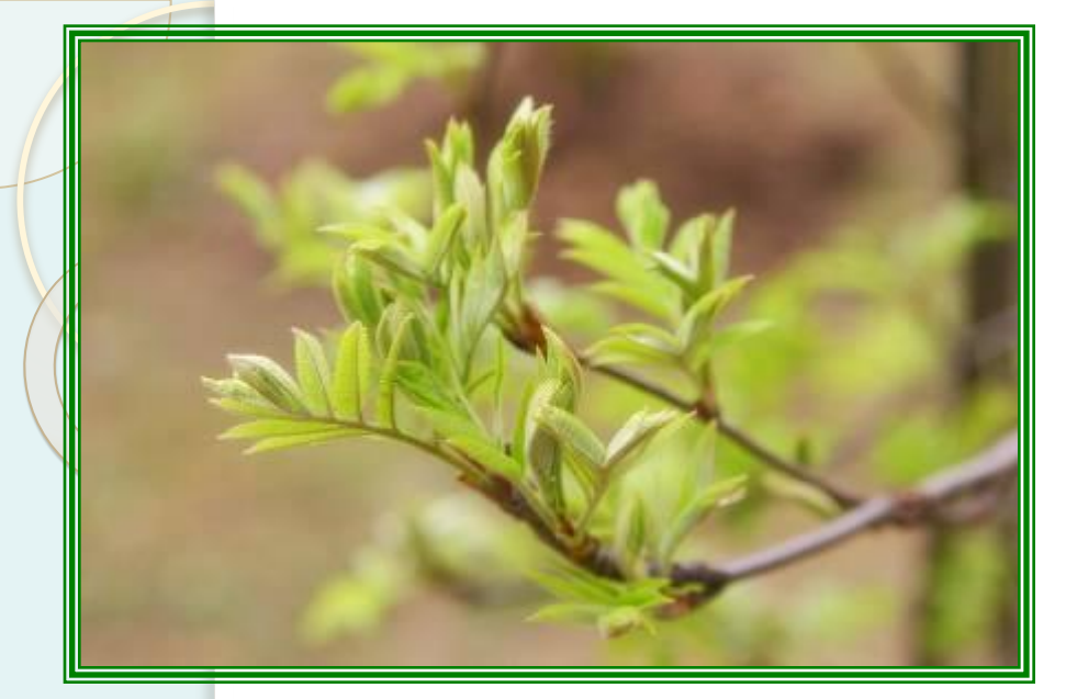
Spring is green