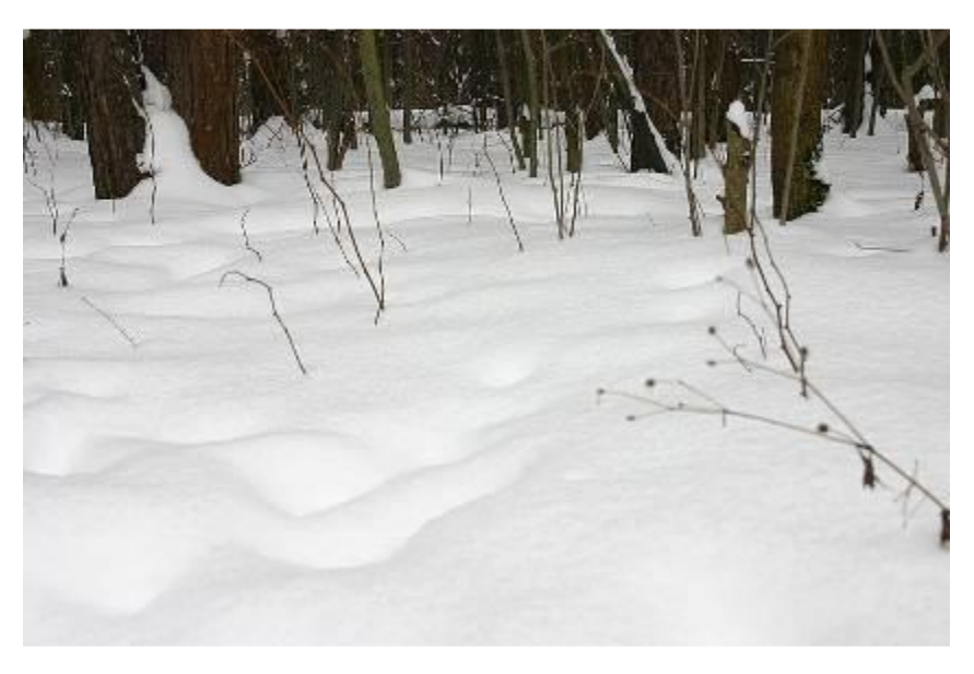
Winter is white