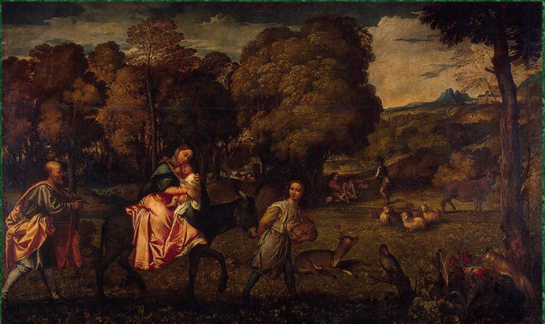
Titian "Escape to Egypt" 1508