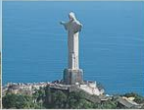
Christ Redeemer, Brazil