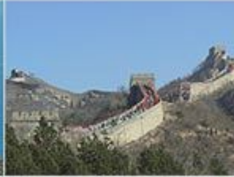
The Great Wall, China