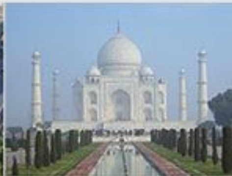
The Taj Mahal, India

As a response to Europe's "Seven Wonders of the World" list, which didn't include any Russian sights, Russia organized a national contest to select the seven most beautiful destinations the country has to offer.