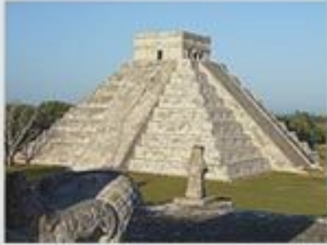
Chichén Itzá, Mexico

The New7Wonders organization is happy to announce the following 7 candidates have been elected to represent global heritage throughout history.