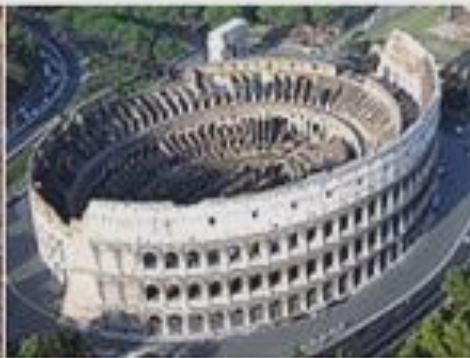
The Roman Colosseum, Italy